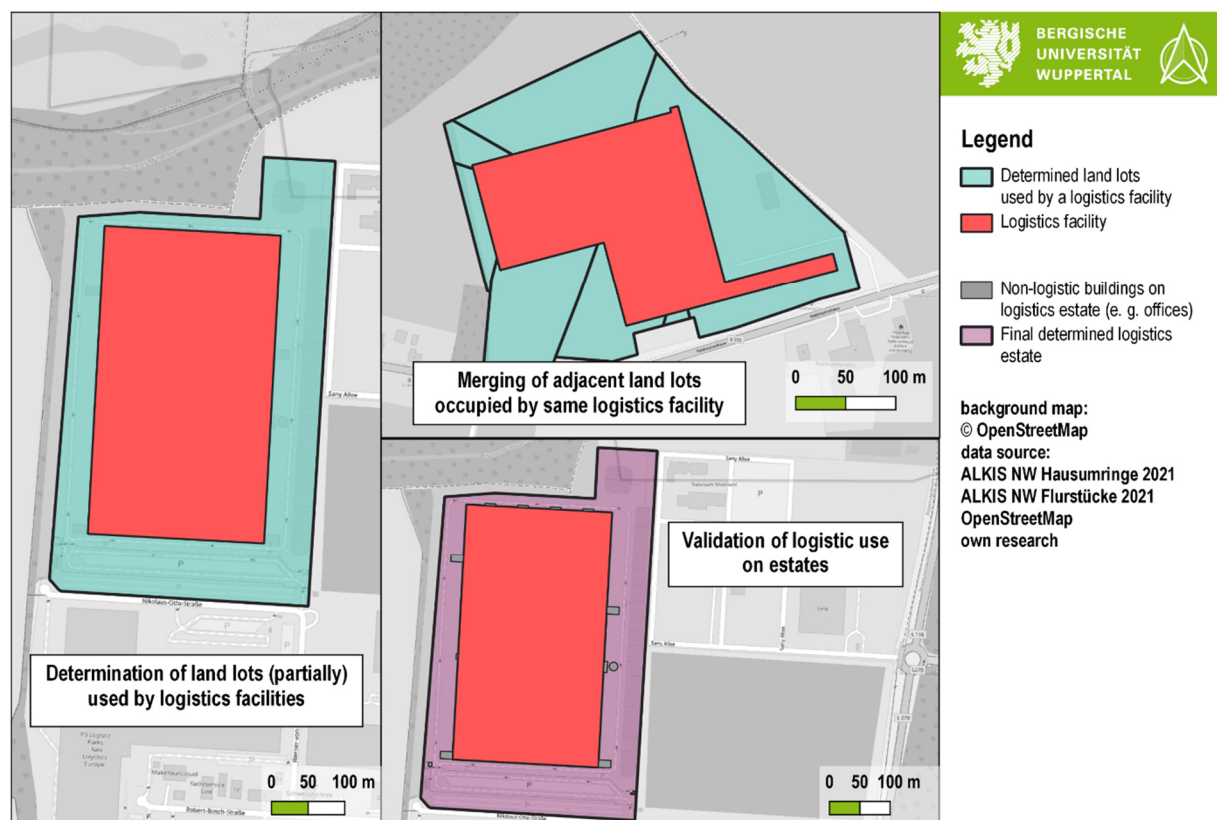
Figure 2: Procedural steps for the identification of logistics land

As a result, 3,251 logistics estates are obtained and remain for further examination.